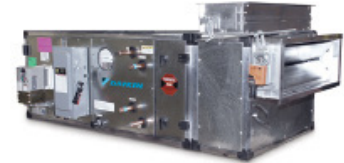
Destiny™ indoor air handler