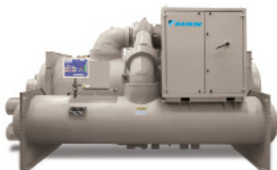
400 to 1500 ton