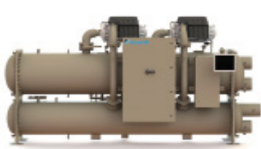
Magnitude magnetic bearing chiller