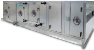
Vision™ indoor air handler

Choose a Daikin air handler or terminal unit