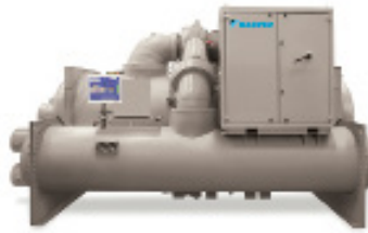
Magnitude magnetic bearing chiller