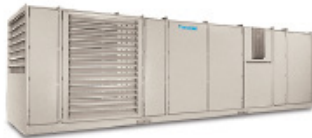
RoofPak™ outdoor air handler