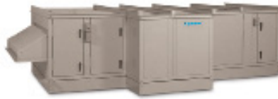
Skyline™ outdoor air handler